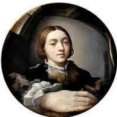
Parmigianino, Self-portrait in a mirror is itself painted on a convex surface, like that of the mirrors of the period.

A self-portrait is a portrait an artist makes using himself or herself as its subject . The self-portrait supposes in theory the use of a mirror ; glass mirrors became available in Europe in the 15th century. The first mirrors used were convex, introducing deformations that the artist sometimes preserved. A painting by Parmigianino in 1524 Self-portrait in a mirror , demonstrates the phenomenon.