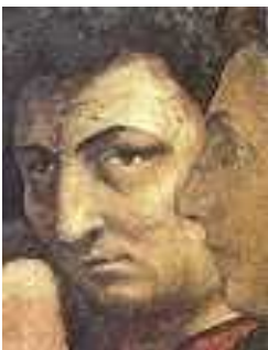
Masaccio inserted self-portrait from the Brancacci Chapel frescoes.