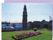
Torre dos Clérigos

The history of this town began in the V century during Roman times and the city developed its importance as a commercial port, taking the name Portus Cale . Before Arabian occupation , Portugal became an independent Kingdom and in the 14th and the 15th centuries , the shipyards of Porto contributed to the development of the Portuguese fleet. On 1754 an Italian architect, Nicola Nasoni made a project of a tower that became the icon of the town ( Torre dos Clérigos ). During XVIII and XIX century , Porto became a very important industrial center and increased its dimension and population.